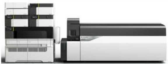
Fig. 1 Shimadzu LCMS-8045

Milk sample procured from local market, was used to prepare matrix-matched calibration standards and fortified samples. The calibration standards were analyzed in the range of 2.5 to 40 µg/L. Calibration curves were generated by external standard method and using weighted regression of 1/C 2 . Fortified samples were prepared in six replicates of each 5 and 10 µg/kg. The compounds marked with asterisk (*) in summary result tables; were present in both LCMS and GCMS standard mixture. Hence their calibration range and spiking levels were two times the concentration levels mentioned above.