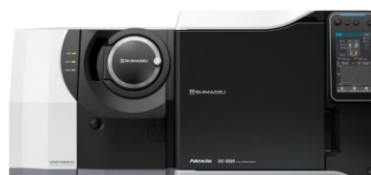
Fig. 2 Shimadzu GCMS-TQ8040 NX

All samples were analysed as per conditions shown in Table 2 and 3 for LC-MS/MS and GC-MS/MS, respectively.