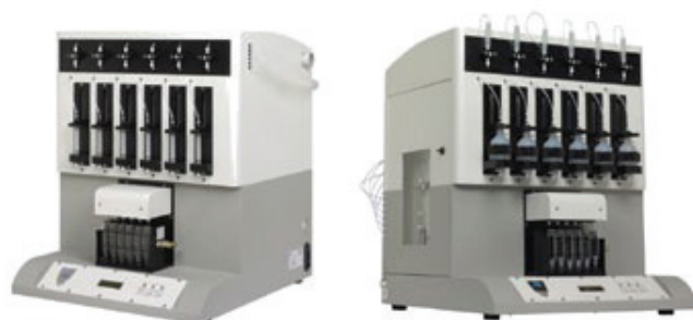
FIGURE 1. Dionex AutoTrace 280 SPE instrument cartridge system (left) and disk system (right).