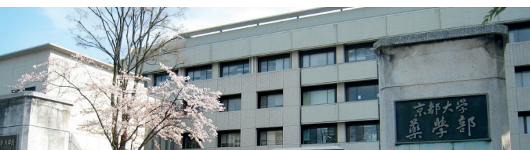
Graduate School of Pharmaceutical Sciences, Kyoto University