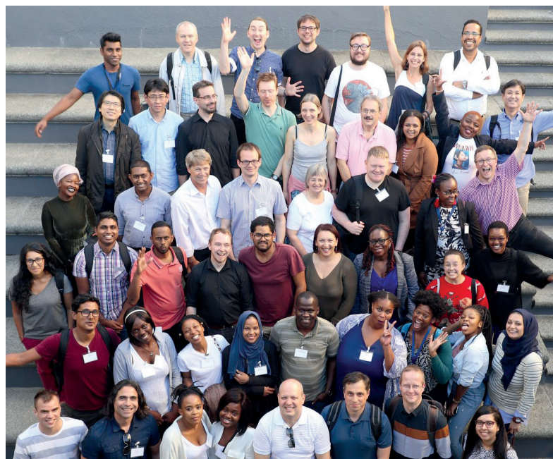
Attending HUPO Proteomics Standards Initiative meeting 2019 in Cape Town, South Africa

identify all the proteins that can be expressed, but also to uncover cellular protein events such as (1) protein expression/degradation, (2) protein localization, (3) protein interaction, (4) protein post-translational modifications (PTM), and (5) protein processing/splicing.