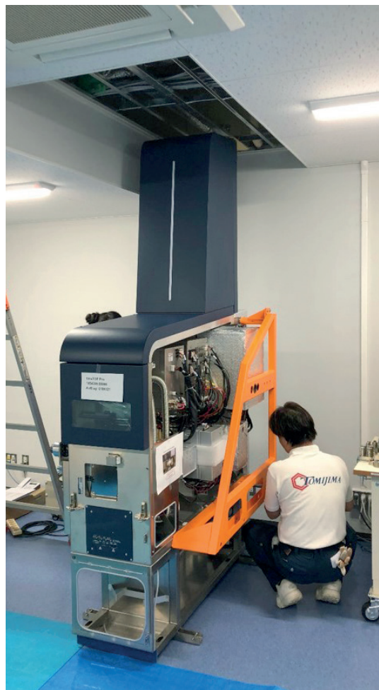
First instrument in Japan (May, 2018): The Japanese room is not high enough for the tall German timsTOF Pro