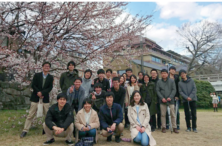
Four new members join the MCBA laboratory in April 2019

"I worked in a pharmaceutical company for 14 years after I completed my studies. I then moved back to academia in 2006, at a time when proteomics was just emerging, so it was a great time to enter the field. There have been many technological improvements and developments, but still new technology is needed to drive the field. That's where my background in analytical chemistry is useful and can be applied to life science."