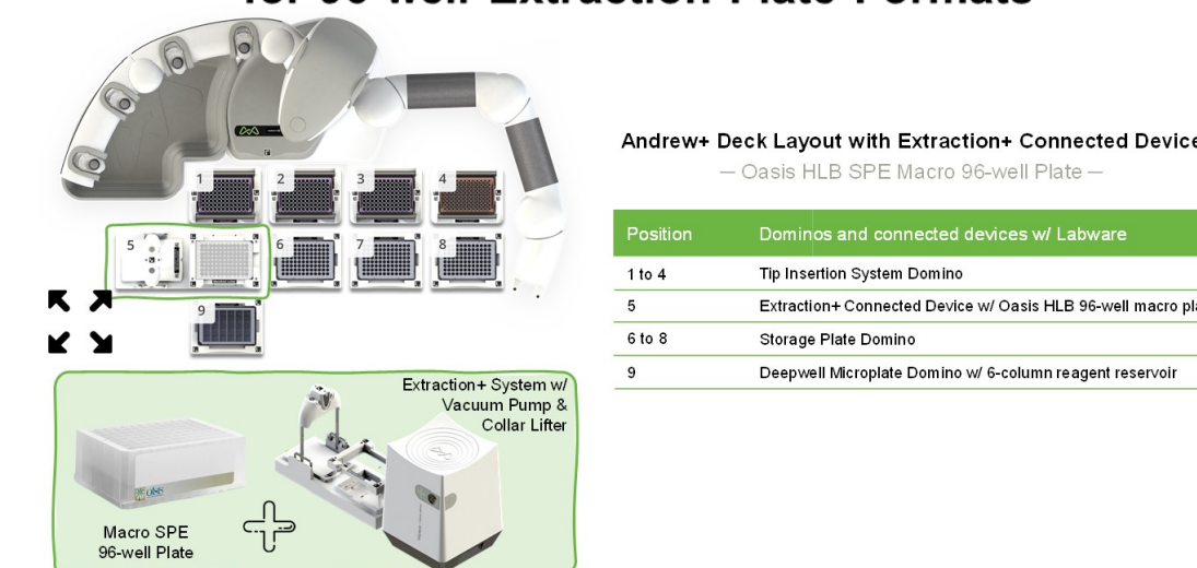
Figure 3. Representative Andrew+ Pipetting Robot with Extraction+ Connected Device and OneLab Software method with protocol visualization, system components identification, and representative Andrew+ deck layout.