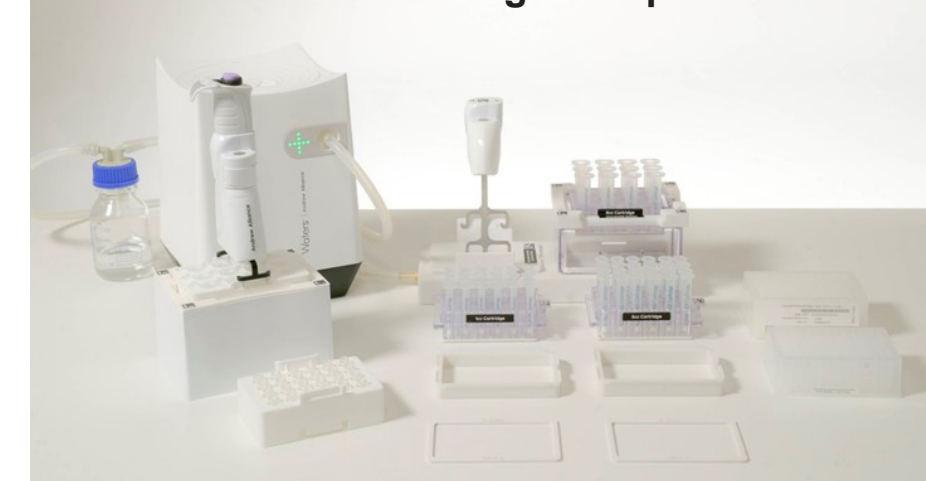
Figure 2. The Extraction+ system including the Extraction+ connected vacuum pump, flow-through waste container, Extraction+ manifold with the manifold collar, the integrated collar lifter, and SPE cartridges (1, 3 and 6 cc) with the corresponding adaptors.