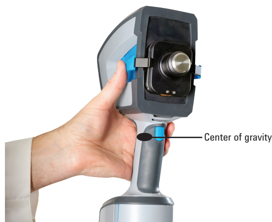
Figure 1. Agilent 4300 Handheld FTIR. The center of gravity is located in the center of the handle as shown by the black dot. This balances the instrument in the user's hand, providing superior ergonomics for consistent data collection.