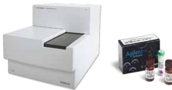
Agilent’s microarrays provide superior sensitivity and maximum design flexibility with either defined or completely customizable content.