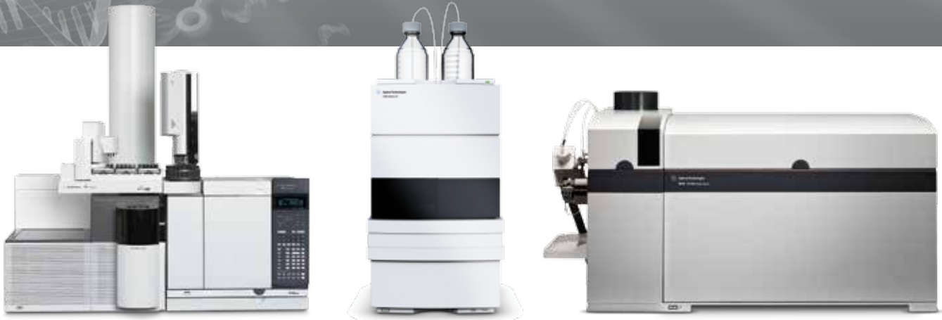
The Agilent 7200 Q-TOF GC/MS system (left) combines unmatched separation power with advanced high-performance accurate mass analysis. It enables you to screen your samples for virtually unlimited numbers of known analytes, or analyze for unknown or emerging contaminants. The Agilent 8800 Triple Quadrupole ICP-MS (right), combined with our 1200 Infinity Series LC (center), delivers accurate and sensitive mass detection. It is especially well-suited for trace level analysis from complex sample matrices.