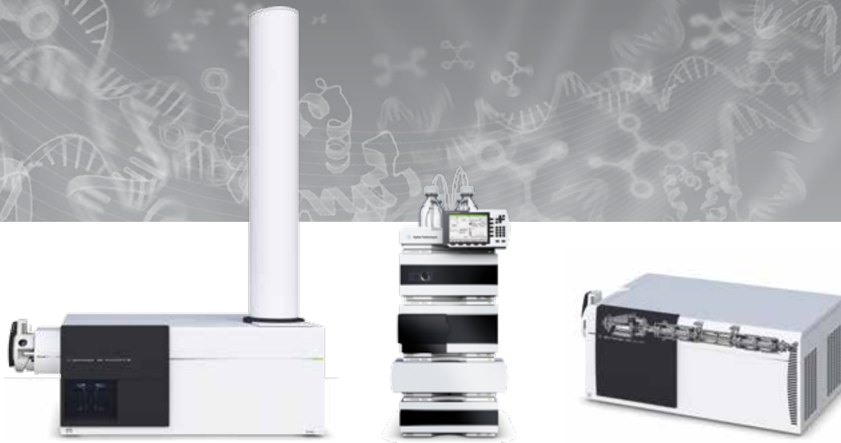
The Agilent 6550 Q-TOF (left), combined with the 1260 HPLC system (center) is the perfect choice for discovery metabolomics, biomarker discovery, and clinical research. The Agilent 6460 Triple Quadrupole mass spectrometer (right) provides ultra-sensitive detection, ideal for quantitation and targeted analysis.