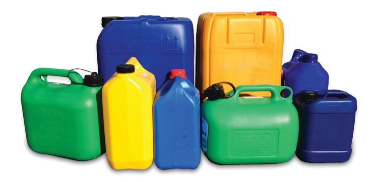
Figure 3. Improvised Explosive Devices (IEDs) are frequently packed in opaque colored plastic containers.

The Resolve system was set up to record measurements in through-barrier mode. Samples were either full-size containers filled with the material in question (for example, palm oil) or a smaller package of the material in question taped to the inside of the larger container (for example, TNT). Some more sensitive samples (for example, TATP or primaries) were set up under explosive range conditions using around 5–10 g of material positioned behind a cutout of the same plastic barriers.