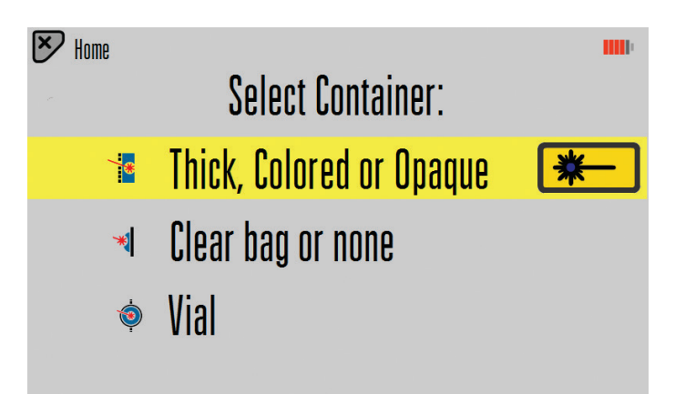
Figure 1. Selections for through-barrier, point-and-shoot, or glass vial measurements.

To conduct a Resolve system measurement, the user simply selects the container type. The tests described here are through-barrier measurements (Thick, Colored or Opaque is selected) (Figure 1).