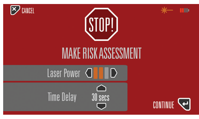
Figure 2. Risk assessment screen for setting a time delay or reducing laser power.

Use care and caution when scanning suspected explosive materials. The Resolve system can be operated using a scan delay or remote trigger. Laser power can also be reduced. (Figure 2).