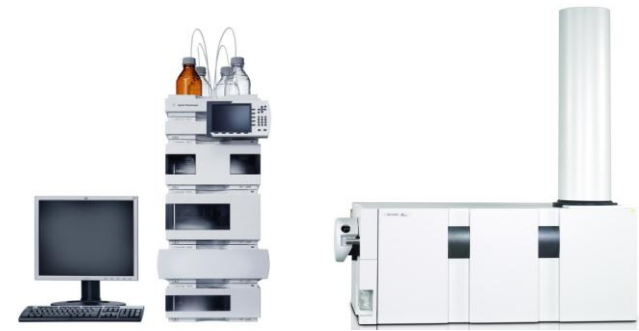
Configuration 2: 1200 HPLC Stack with 6540 UHD Accurate-Mass Q-TOF LC/MS