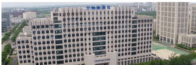
CAIQ laboratory, Beijing.

"The refinements made to the UPC 2 System, specifically the pump and detector designed for supercritical fluids, has resulted in a separation tool that solves both routine and complex chromatographic problems, and is particularly useful for samples possessing a wide range of polarities."