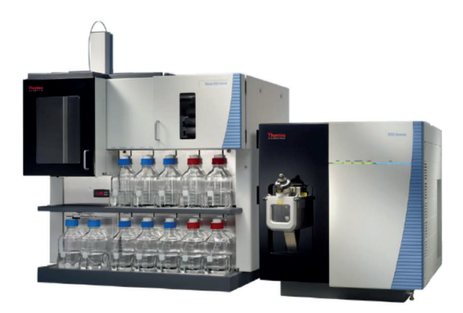
Figure 1. Prelude SPLC system with TSQ Endura triple quadrupole mass spectrometer