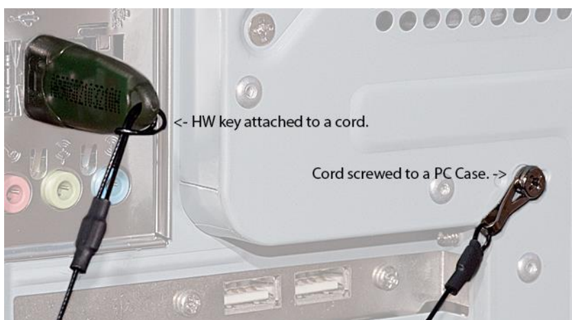
Safeguard attached to the backside of the PC using a screw.

The size of the metal eyelet fits the screws that are used in most PC Cases.