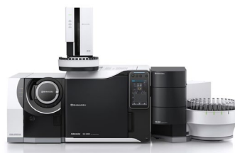
Fig. 3 HS-20 NX + GCMS-QP2020 NX

The headspace (HS) method is a technique for pretreating vaporized volatile compounds before injection into a GC unit. Due to the ease and simplicity of sample preparation for the HS method and the good reproducibility it provides, the HS method is commonly used for routine analysis in quality control applications. In this example, a trap model of the HS-20 NX (Fig. 3) was used to pretreat samples by the trap headspace method. The trap headspace method enables high sensitivity analysis of aroma compounds because it concentrates compounds in an electronically-cooled trap.