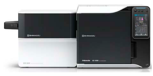
Fig. 3 Nexis<sup>™</sup> GC-2030 equipped with Nexis SCD-2030 detector