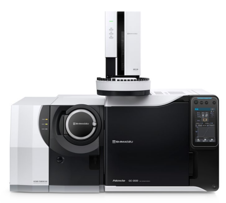
Fig. 1 AOC-30i + GCMS-TQ<sup>™</sup>8040 NX

In Application News 01-00526, the article "Quantitative Analysis of 57 Fragrance Allergens in Cosmetics Using Twin Line MS System", introduced an example of analysis for fragrance allergens in cosmetics using a single quadrupole GCMS. However, in complex matrix samples like cosmetics, accurate quantitation can be hindered by the interference of impurities. In such cases, performing MRM analysis with a triple quadrupole GCMS is expected to improve measurement accuracy. This Application News presents the results of investigation on how to further enhance sensitivity, accuracy, and analytical stability using a triple quadrupole GCMS.