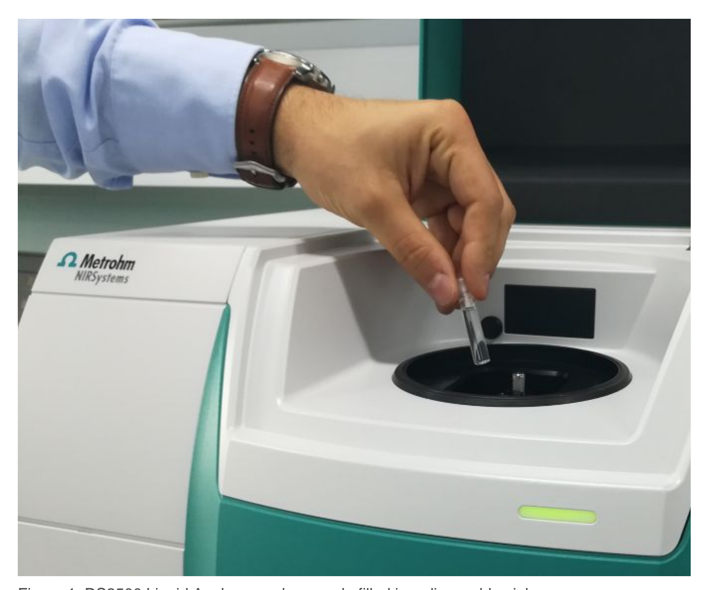
Figure 1. DS2500 Liquid Analyzer and a sample filled in a disposable vial.

Mixtures of ethanol/water standards with a range of ethanol content from 58% to 82% (v/v) were measured in transmission mode with a DS2500 Liquid Analyzer over the full wavelength range (400–2500 nm). Reproducible spectrum acquisition was achieved using the built-in temperature control at 40 °C. For convenience, disposable vials with a path length of 8 mm were used, which made cleaning of the sample vessels unnecessary. The Metrohm software package Vision Air Complete was used for all data acquisition and prediction model development.