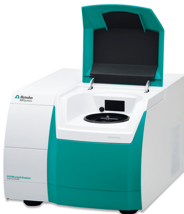
Figure 1. Metrohm DS2500 Liquid Analyzer used for the determination of research octane number (RON) in isomerate samples.