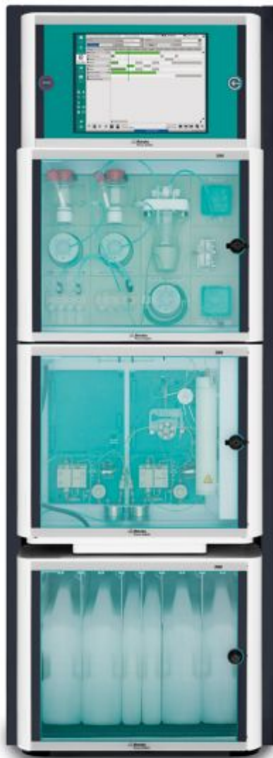
Figure 3. The 2060 IC Process Analyzer is available with either one or two measurement channels, along with integrated liquid handling modules and several automated sample preparation options.

These cations and more can be determined down to the sub-g/L range in a single analysis using ion chromatography. However, precise, reliable trace analysis requires the method to be automated as much as possible. Metrohm Process Analytics offers a complete solution for this