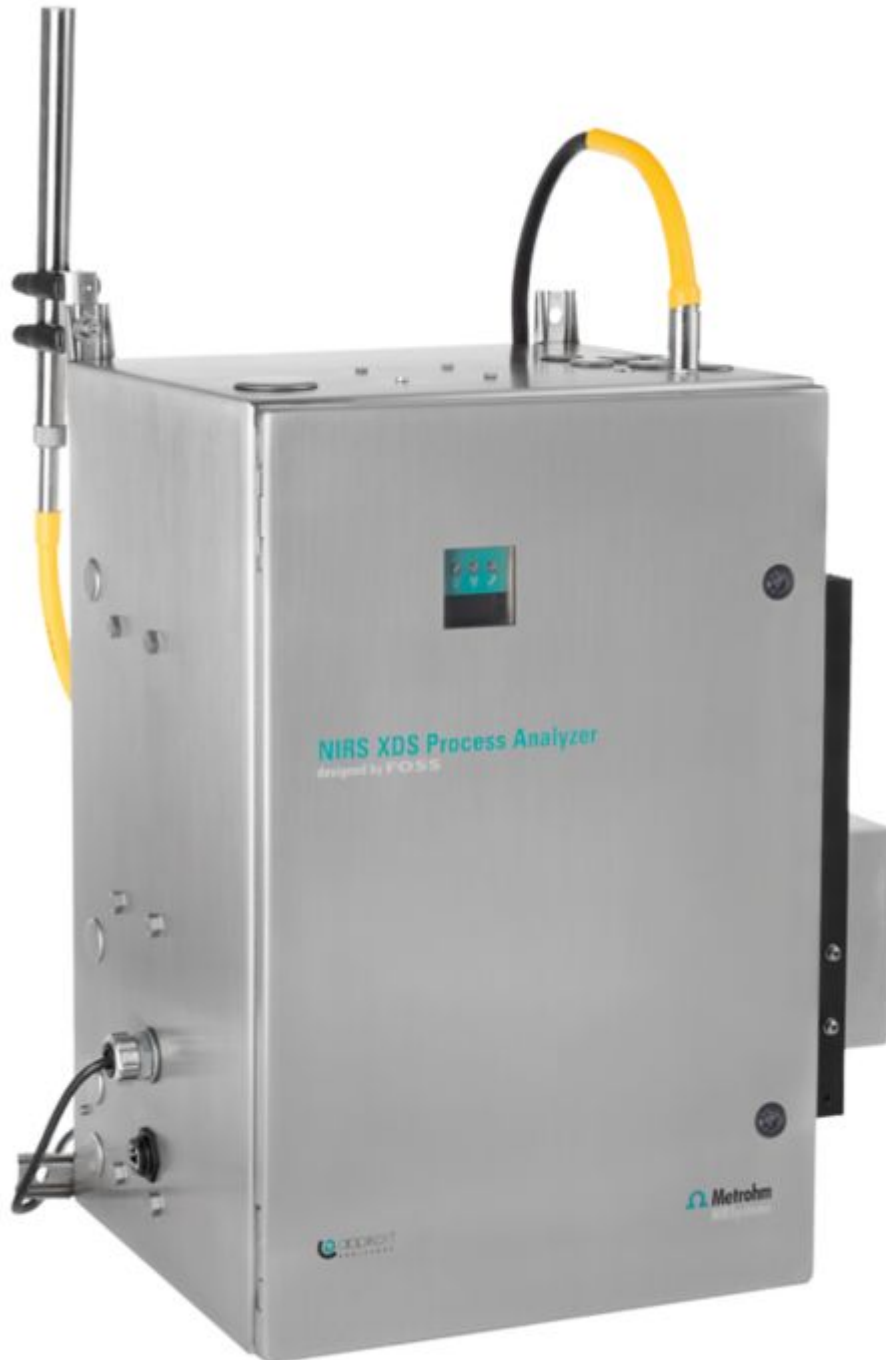
Figure 2. NIRS XDS Process Analyzer from Metrohm Process Analytics.

Wavelength range used: 1100–1650 nm. Inline analysis is possible using a micro interactance reflectance probe with purge on collection tip directly in the fluid bed dryer.