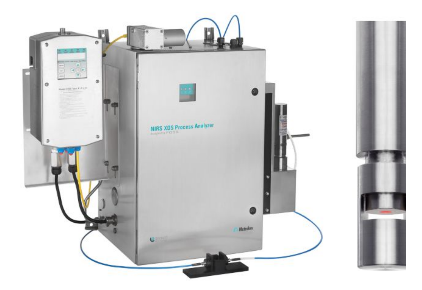
Figure 2. NIRS XDS Process Analyzer configured for applications in ATEX areas, inset shows immersion probe.

Inline analysis is possible using the properties of transflectance and the micro interactance immersion probe. The sample flows through the gap between the probe body and high-energy mirror tip. An adjustment of this mirror tip defines the pathlength which is equal to two times the gap for precise analysis.