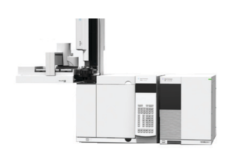
The Agilent 240 Ion Trap MS connected to the Agilent 7890A GC