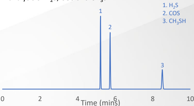
Fig 2. H2S, COS and CH3SH in natural gas

Figure 2 shows the chromatogram of the PFPD analysis of H_2S , COS and CH_3SH .