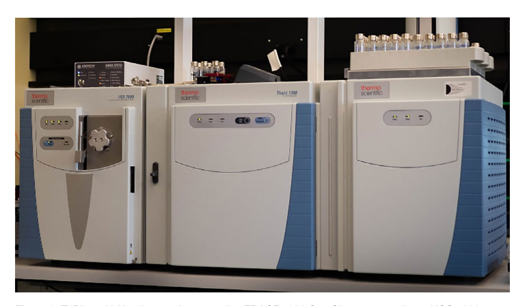
Figure 2. TriPlus 500 Headspace Autosampler, TRACE 1300 Gas Chromatograph, and ISQ 7000 Single Quadrupole GC-MS

Gas chromatography separations were carried out on the Thermo Scientific™ TRACE™ 1300 Gas Chromatograph with the Thermo Scientific™ TriPlus™ 500 Headspace Autosampler, using a Thermo Scientific™ TraceGOLD TG-35MS 30 m × 0.25 mm i.d. × 0.25 µm capillary GC column (P/N 26094-1420). The MS analysis was performed on a Thermo Scientific™ ISQ™ 7000 Single Quadrupole GC-MS system (Figure 2).