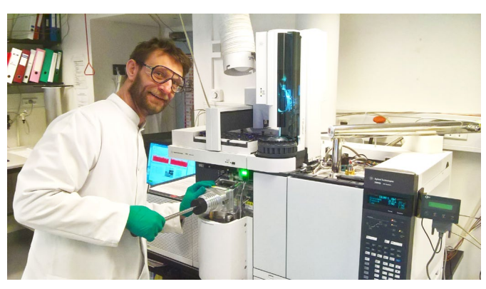
Location: University of Copenhagen, Copenhagen, Denmark Key Technologies: GCxGC, GC/QTOF, GC/MS Main Application Area: Environmental www.ku.dk