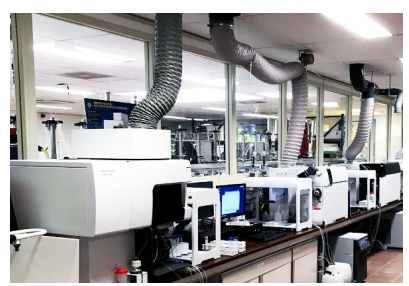
Location: Eurofins Analytico, Barneveld, The Netherlands

Key Technologies: ICP-OES, ICP-MS and ICP-MS-MS