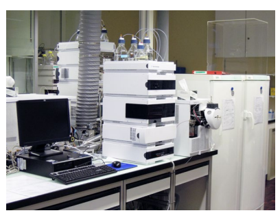
Location: University of Applied Sciences and Arts Northwestern Switzerland (FHNW), Basel, Switzerland

Key Technologies: LC/MS/MS, LC-QTOF, UHPLC, GC/MS