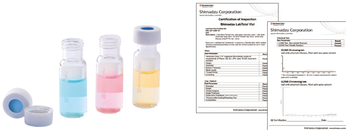
Mass spec quality certificate

The bleed of the septum from siloxane bonds is very low due to the use of high-quality silicon polymer and a specific cleaning technique. This confirms that there was an absence of elution components from the vial in random inspections using GC/MS and LC/MS. A mass spec quality certificate is included with each CQ vial kit.