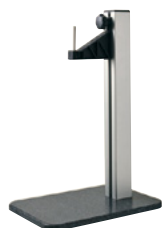
Base for auto crimper/decapper