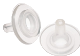
Xtra Clean Conical cap