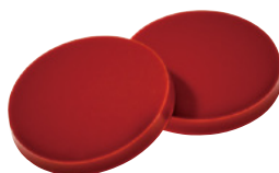
Xtra Low Bleed HS septum

Elution of the bleeding components is low even if the temperature is kept at 300 °C, enabling analysis at high temperatures, which had been difficult with a headspace sampler.