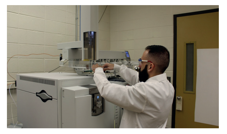
The Thermo Scientific Orbitrap Exploris GC 240 system in the Bowden laboratory

Prior to acquiring the Orbitrap Exploris GC 240, the team performed metabolomics studies solely using LC-MS/MS workflows on the Q-Exactive system. "The utilization of GC for metabolomics is gradually starting to receive the same level of attention as LC-MS-based approaches," says Dr. Bowden. "Incorporating both LC and GC into our metabolomics workflow has immensely broadened our compound identification capability. We can now identify a multitude of compounds ranging from volatile to nonvolatile, stable to thermally unstable and polar to nonpolar, providing us with a more comprehensive profile to interrogate."