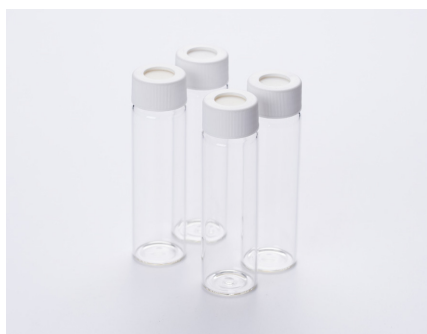
Fig. 1 "CQ Vial™ for TOC Analyzer" Pre-Cleaned Vials with QC Certificate of Analysis