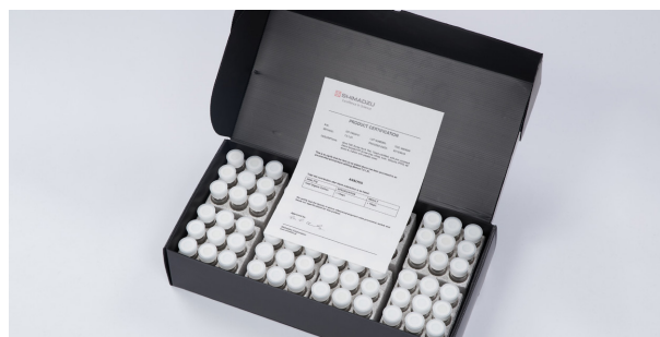
Fig. 2 Appearance of CQ Vials and QC Certificate of Analysis

CQ vials are manufactured and cleaned in accordance with a strict procedure. After manufacture and cleaning, a dustproof cap is placed on each vial, and the vials are packed in a box made of dust-free plastic material. A lot number is assigned to the product, which is shipped with a QC Certificate of Analysis declaring that elution into the vials does not exceed 10 µg/L (i.e., carbon concentration of 10 µg/L).