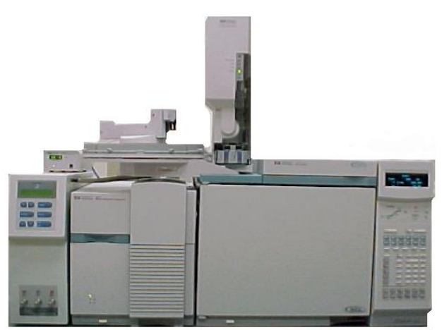
HP6890/5973 with OPTIC2 8270 Injection System

<sup>1</sup> USEPA SW-846, Method 8270C, Revision 3, December 1996.