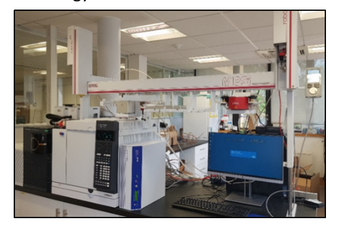
Figure 1: GERSTEL Dual Head Robotic MPS on top of Agilent GC 7890B coupled to 7250 Q-TOF MS

<u>GC-MS</u>: Agilent GC 7890B coupled to Agilent 7250 Q-TOF MS, Low energy EI source