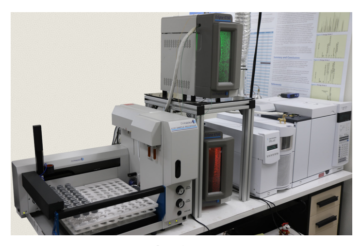
Figure 1. 4100, 4760, and GC/MS

The purpose of this paper is to use Method criteria from 624.1 and 8260 in a way that will most effectively and efficiently allow labs to run 624 and 8260 in the same batch.