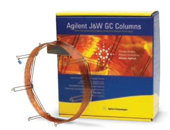
Agilent J&W GC columns Depend on the sharpest peaks, the best inertness, and the tightest column-to-column reproducibility.