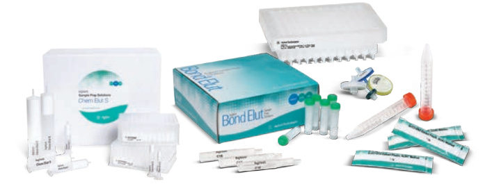
Agilent sample preparation products Eliminate laboratory variability and ensure consistent flow, cleanliness, and recovery.