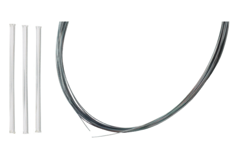
Agilent Press Fits and guard columns Extend the lifetime of your column by using deactivated tubing and connectors.

DF44153 374490740 formation is subject to change without notice © Agilent Technologies, Inc. 2022 Printed in the USA, August 1, 2022 5991-3907EN