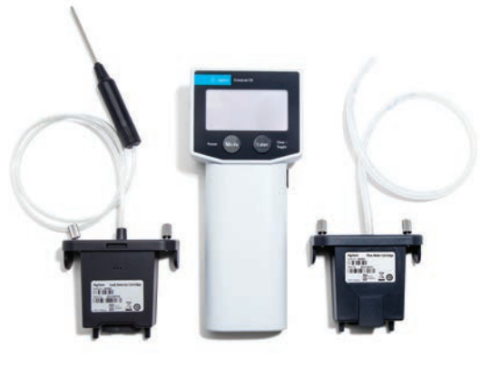
Agilent CrossLab CS Electronic Leak Detector and ADM Flow Meter The Agilent CrossLab Cartridge System (CS) design is unique to the market. It combines the two most critical GC flow path monitoring tasks into a single hand-held system.