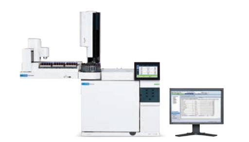
Agilent GC and GC/MS systems combined with OpenLab CDS and MassHunter software Perform consistent chromatography and keep pace with stringent new methods and demanding sample loads.

DF44153 374490740 formation is subject to change without notice © Agilent Technologies, Inc. 2022 Printed in the USA, August 1, 2022 5991-3907EN