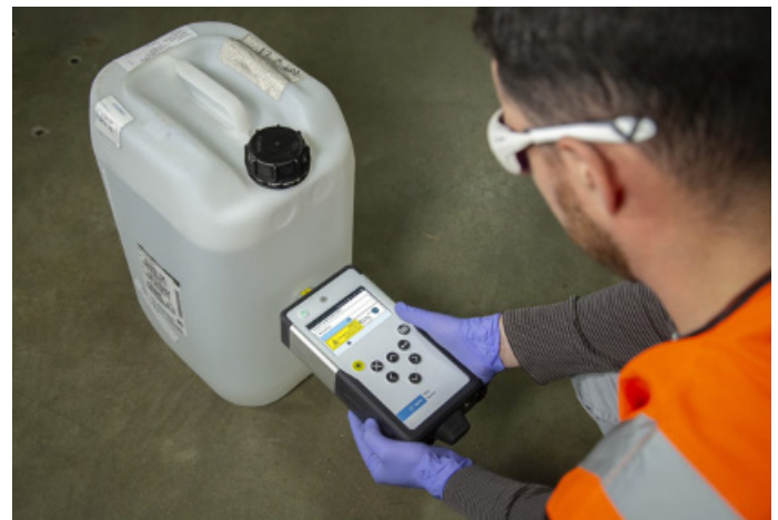
Figure 2. A Vaya verifies the identity of acetic acid in an opaque plastic carboy container.

By verifying ID directly through the container, a Vaya system helps preserve inert packaging conditions and maintain the expiration date of raw materials. For air sensitive materials like polysorbates, it means that materials can be fully used before the expiration date instead of being discarded. This alone can easily translate into savings >$100 per tested container.