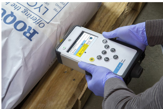
Figure 1. Vaya identifies raw materials through multilayer paper sacks.

The Vaya is a handheld SORS-based spectrometer from Agilent. The Vaya is the fastest handheld identity verification solution available. For example, it can verify lactose monohydrate in a three-layer paper bag in 80 seconds. Citric acid in a white HDPE bottle can be identified in 15 seconds with no sampling and no mess. It drastically simplifies the identification process by enabling almost instantaneous screening of incoming containers on arrival. The Vaya system can verify the identity of raw materials in quarantine with a single operator. Unnecessary movement of containers, sampling booth clean up, sampling consumables, and PPE for testing personnel are all reduced.